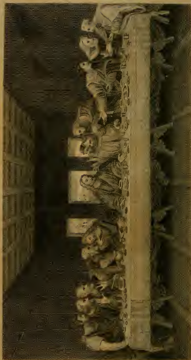
THE LASSA SUPPER.